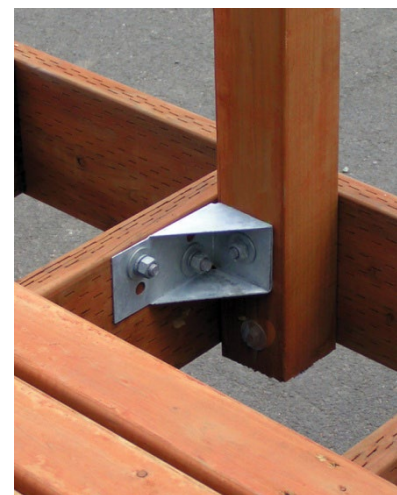
FIGURE 2—TYPICAL BRACKET INSTALLATION